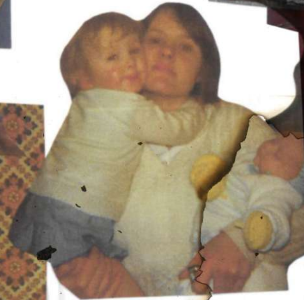
"Raised on a diet of broken biscuits"